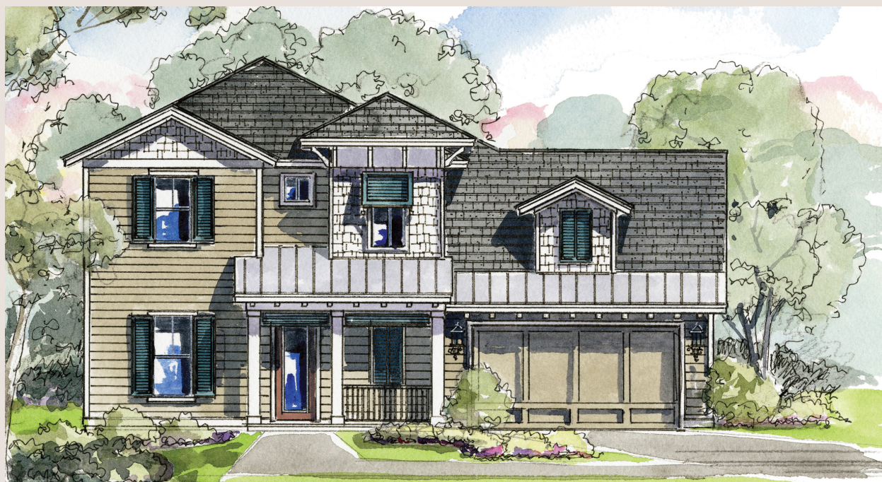
Elevation A – Coastal