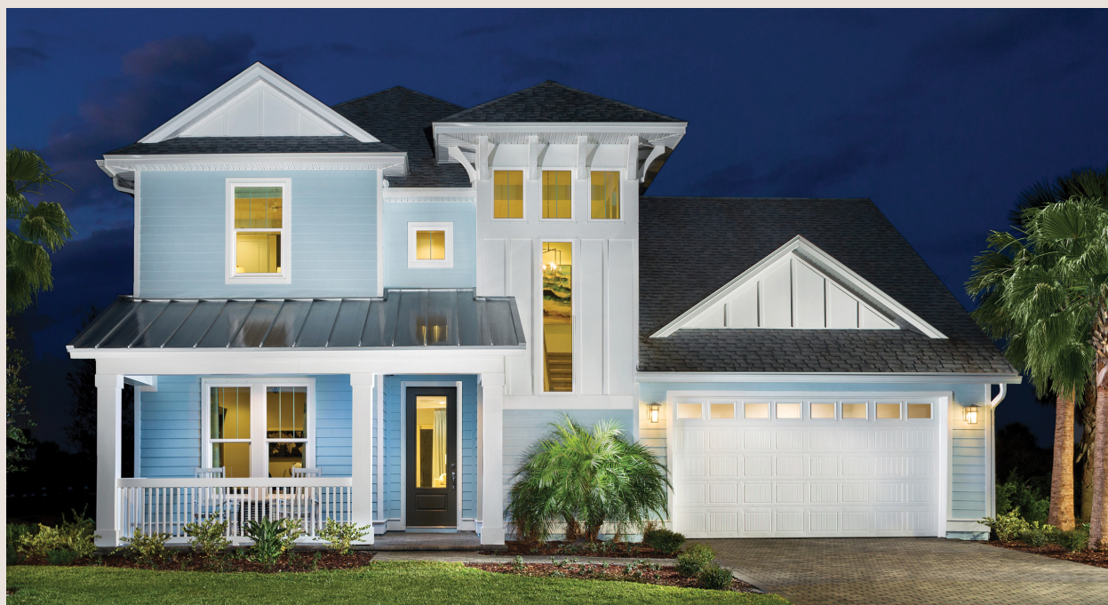
Elevation C – Coastal